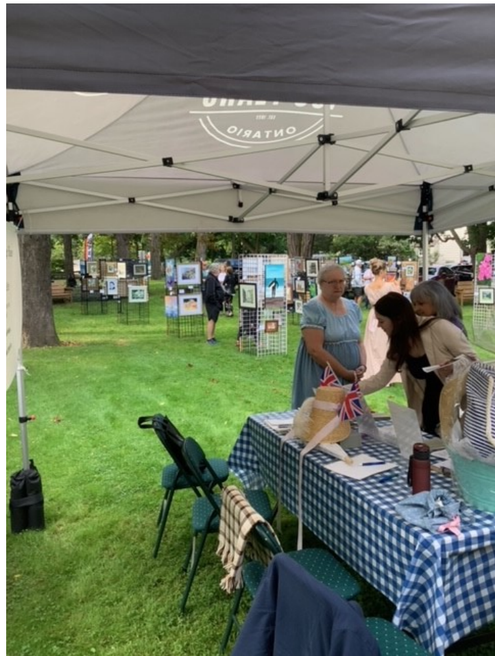
Our tent where four guests were welcomed

All donations to Nelles Manor are tax deductible and a donation receipt for tax purposes will be issued for amounts over $20