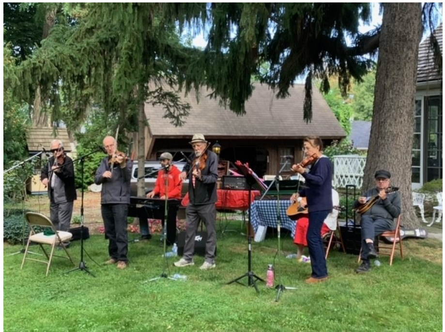
Niagara Old Tyme Fiddlers

At Nelles Manor Museum we bring History to Life